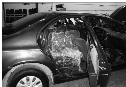
Right: A car loaded with drugs and guns is impounded.