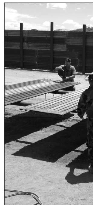
Above: KyANG civil engi Bisbee, Arizona.