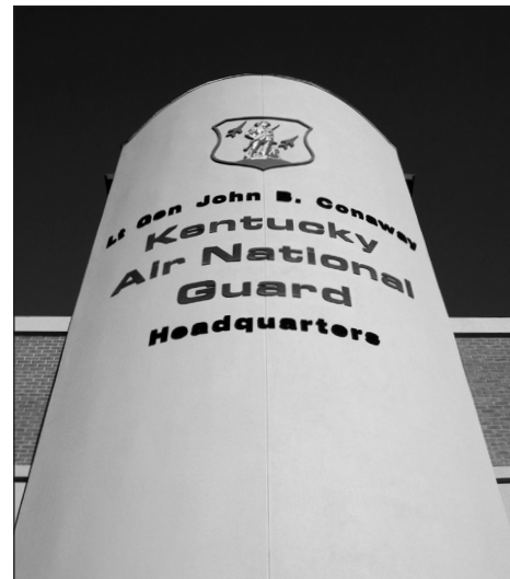
Capt. Dale Greer/KyANG