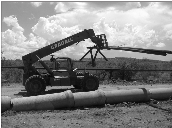
Left: An Airman hauls completed Normandy Barricades to the installation site, where they will be welded to other segments.