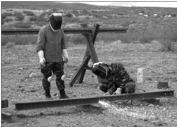
Left: Welders with the 123rd Civil Engineering Squadron prepare railroad rails for use in a type of fencing called Normandy Barricades.