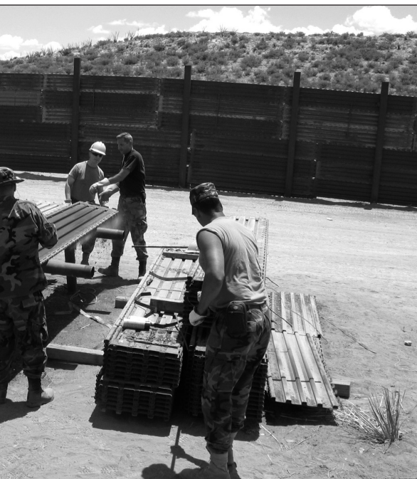
Airmen weld pieces of steel matting together near