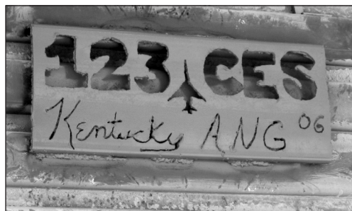
Right, below: Members of the 123rd Civil Engineering Squadron leave their mark in Arizona.