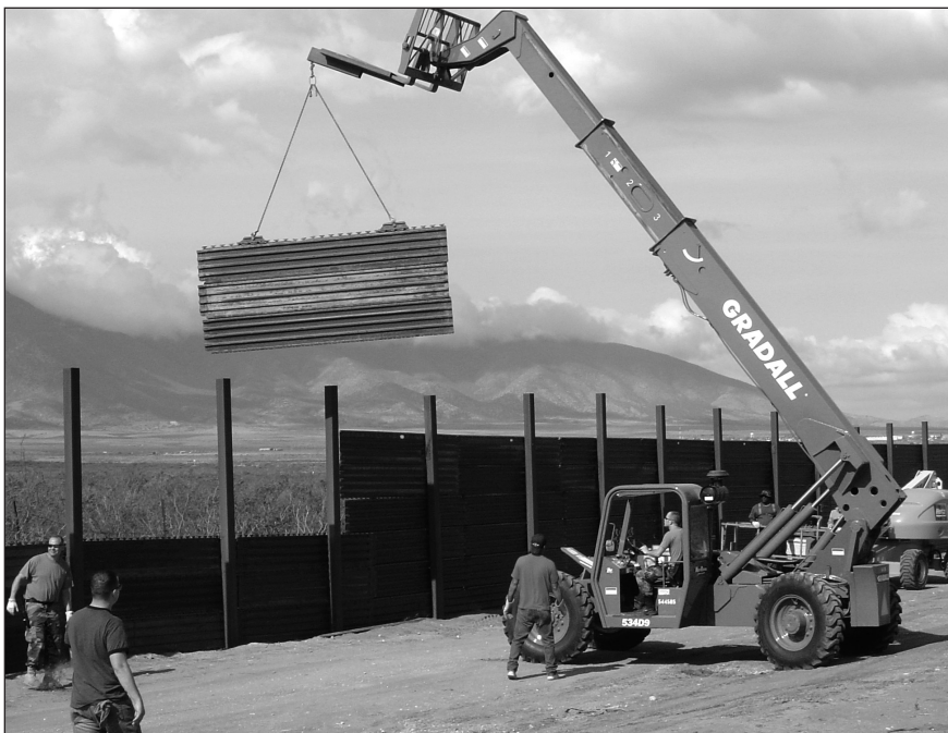
Above: Airmen position the steel matting to extend fencing between the United States and Mexico.